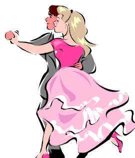
The Cut off date for T-Shirt orders is Monday, April 7