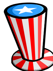
The Parade line up starts at 9 am on Friday, July 4

Bring tools (staple guns , battery powered screwdrivers, hammers, nails) and lots of imagination!